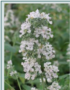
Nepeta cataria , or catmint.

"This new, natural ingredient is particularly exciting because it repels a broad range of biting insects with effectiveness similar to synthetic ingredients such as DEET. Unlike other repellants on the market today, natural refined catmint oil can be