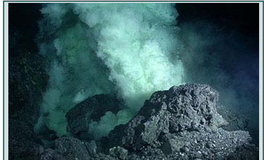
Lava erupts onto the seafloor at NW Rota-1, creating a cloudy, extremely acidic plume.

chief investigator on the expedition, says that they discovered that the volcano had built a new cone 40 meters high and 300 meters wide. Chadwick notes that "as the cone has grown, we've seen a significant increase in the population of animals that lives atop the volcano. We're trying to determine if there is a direct connection between the increase in the volcanic activity and that population increase." Animals in this unusual ecosystem include shrimp, crab, limpets and barnacles, some of which are new species. "They're specially adapted to their