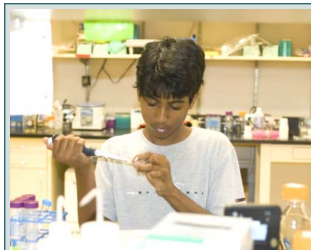
A high school student at work in the lab at part of an Innovative Technology Experiences for Students and Teachers (ITEST) project at Rutgers University.

The Waksman Institute also hosts a Summer Institute where students can begin the DNA sequencing project; but unlike other summer science programs, the teachers of participating students must also attend. At the institute, both teachers and students gain